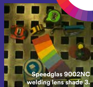
Speedglas 9002NC welding lens shade 3.