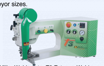
Miller Weldmaster T3 Extreme Welder.