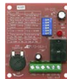
SA-025Q Multi-Purpose Programmable Timer