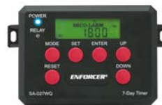
SA-027WQ 7-Day Timer