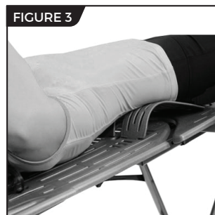
Your inversion table may differ from image shown. Assembly and use of the Lumbar Bridge remains the same.