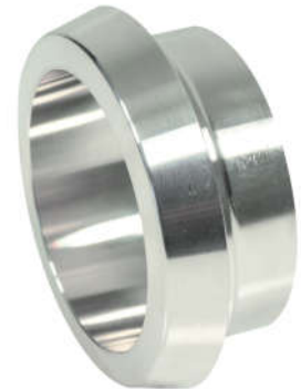
Unit: mm (unless stated otherwise)