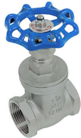
Unit: mm (unless stated otherwise)