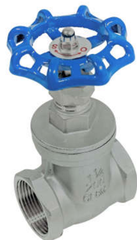
Unit: mm (unless stated otherwise)