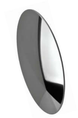
Unit: mm (unless stated otherwise)