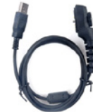
Programming Cable (USB Port) PC38