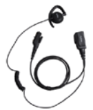
Earset Swivel EHN17