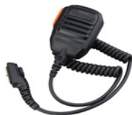
Remote Speaker Microphone (IP57) SM18N2