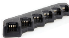
MCU Multi-Unit Charger (For Thick Battery) MCA08