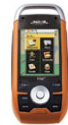
Magellan Triton 2000

When you're shooting in the field, a portable GPS unit lets you know just where you're taking each shot. With a number of newer D-SLRs, you can even connect the GPS to the camera (via an optional GPS connector) and actually record that data with each image. One such connector is the Blue2CAN ( www.redhensystems.com ). Used with a compatible Bluetooth GPS receiver, it automatically records the geo-location of every image with the EXIF header of each file. Some solid portable GPS device manufacturers include Garmin ( www.garmin.com ) and Magellan ( www.magellangps.com ).