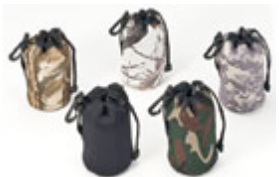
LensCoat Small LensPouch