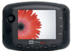
JOBO GIGA Vu extreme

All you really need to take photos is a camera, a lens and some film or a memory card. But there are lots of extras that can help make your photography more efficient, fun and creative.