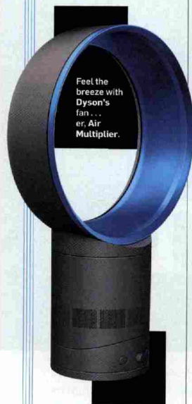
Feel the breeze with Dyson's fan... er, Air Multiplier.

drive. The 4-gig data hauler is nearly impossible to lose, thanks to its proximity to your front-door key. Plus, it's easy to tote around. $25, lacie.com