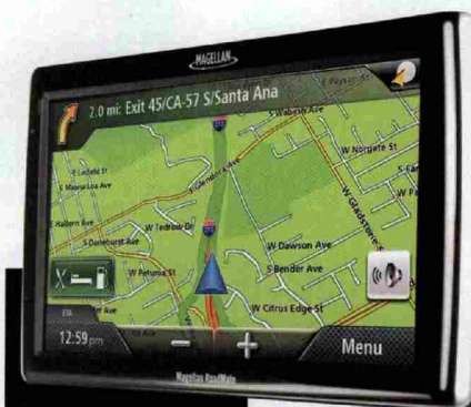
Magellan's RoadMate 1700 improves your view.

Down outerwear can turn your hot spots into sweat pools. Not this climate controller. Thanks to ceramic fibers woven throughout the fluffy stuff, the jacket redistributes heat more evenly throughout the filler, retaining body warmth and giving moisture the boot. We wouldn't hit the slopes without it. $495. powderhornworld.com