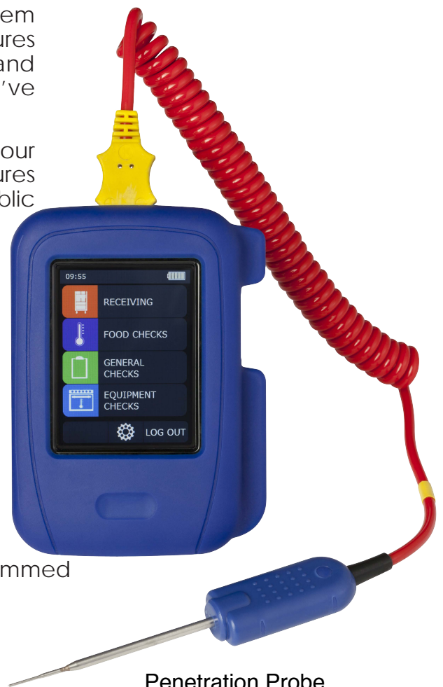
Penetration Probe (comes standard)

**Contract TIP TEMP for your custom program set up**