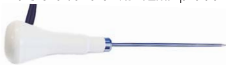
PT22M/W Penetration Probe (3.3mm) Temperature range: -100° to +250°C (-148° to +482°F)

There are several TIP TEMP probe options to use for temperature measurement: