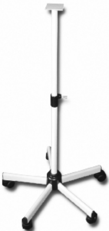
Mobile Stand Adjustable height