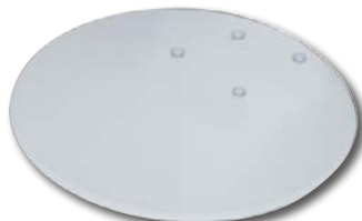
Heavy base 1.5kg