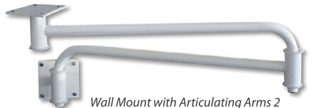
Wall Mount with Articulating Arms 2 x 400mm 3 rotation points